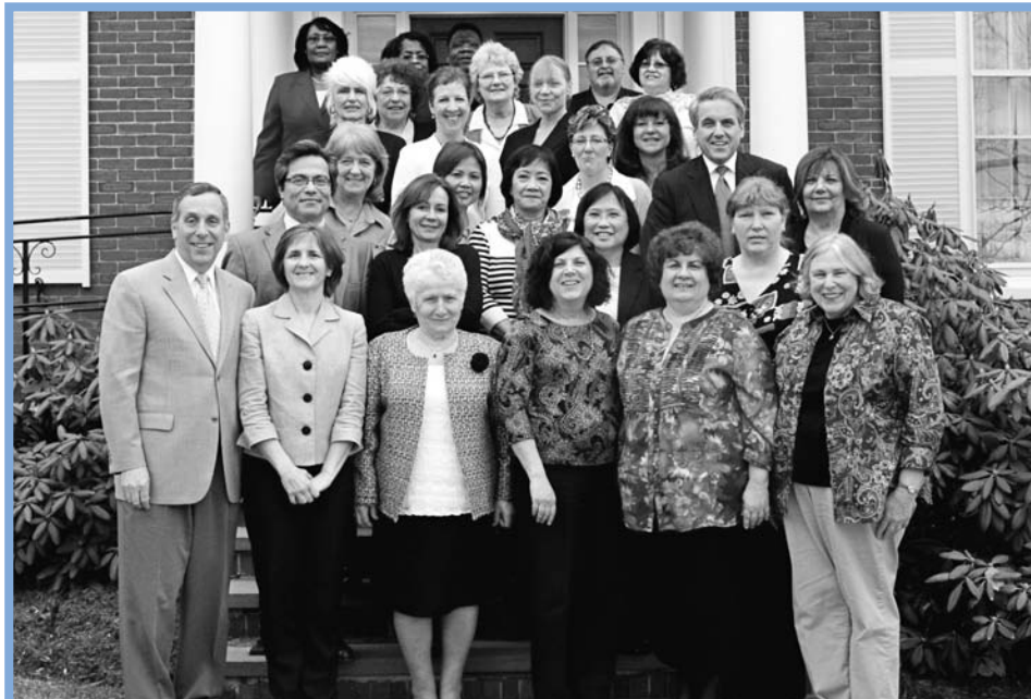
Quarter Century Club Awardees at the 25th Anniversary Luncheon held at Gifford House in March.